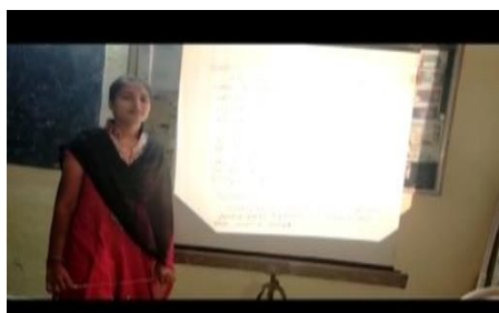
PUSHPA SAI III BIO.Z.C