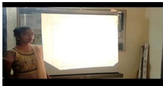
PAVITHRA III BIO.Z.C